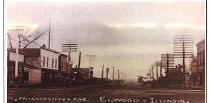
This 1910 photo of Mississippi Avenue is looking west through downtown. The History Club has other photos of the village and township prior to 1899. The Club meets the 2nd Thursday of the month at the Village Hall at 1 PM. Visitors and new members are welcome.