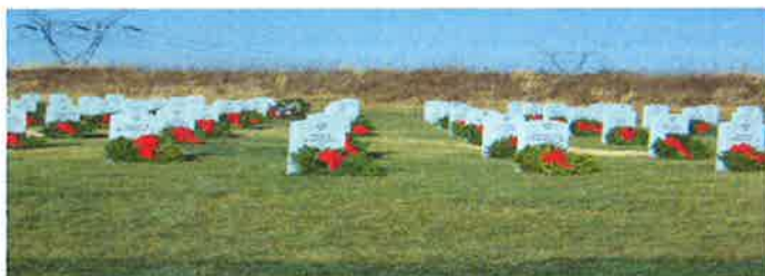
Volunteers with "Wreaths Across American" were busy in mid-December at the Abraham Lincoln National Cemetery placing Holiday wreaths on grave sites.

If you have any questions, please contact the Village Hall at 815-423-5011.