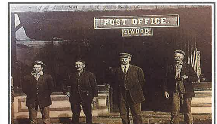
Elwood/Jackson Township Historical Society

You can find both of these presentations on the Village's website www.villageofelwood.com under Village Board, "Financial Management Plan - January 3, 2018". There is also a "Presentations" icon on the home page.