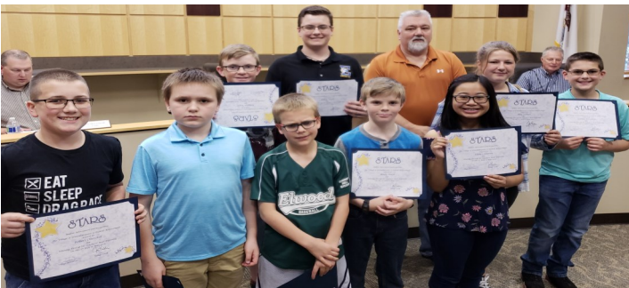
Scholastic Bowl Team Students

At the May 3 rd Village Board meeting, a number of Elwood School students received "Star" awards for their outstanding accomplishments in recent Scholastic Bowl and band competitions.